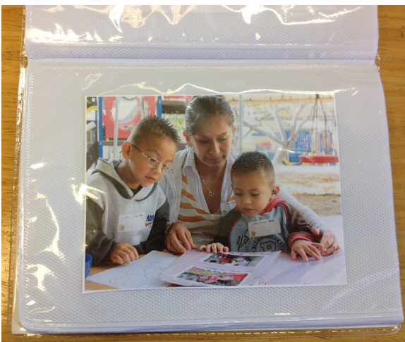
I like to read books