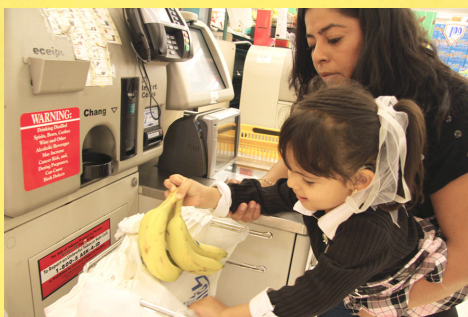
I put the bananas in the bag.