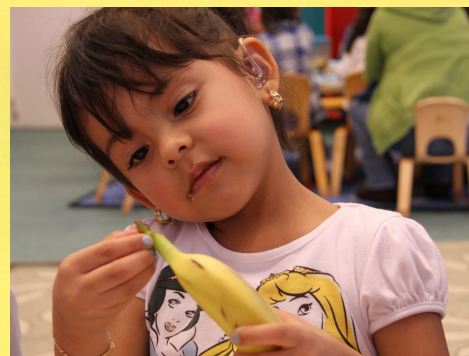
Snack time! Peel the yummy banana.