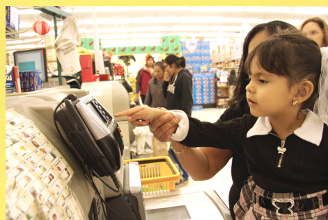
We need to pay. Push the buttons!