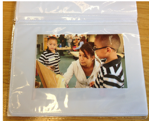
I like to paint pictures.