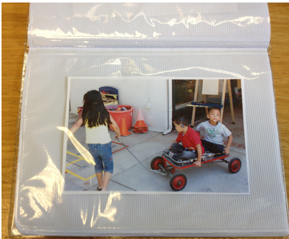
I like to play outside