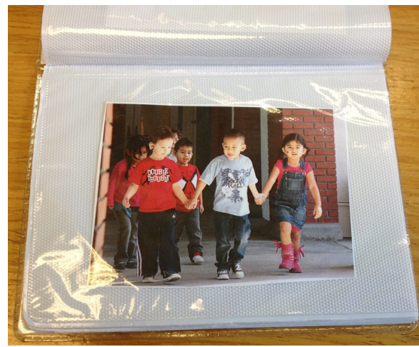
I like all my friends.