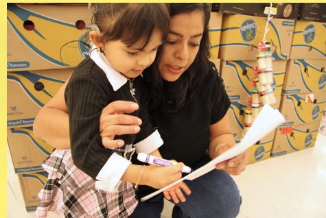
Let's check our list. What will we buy?