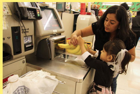
Oh my! The bananas are heavy!