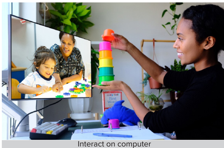
Interact on computer

Learn from home with JTC experts at videoconferences in English for parents to become confident in LSL